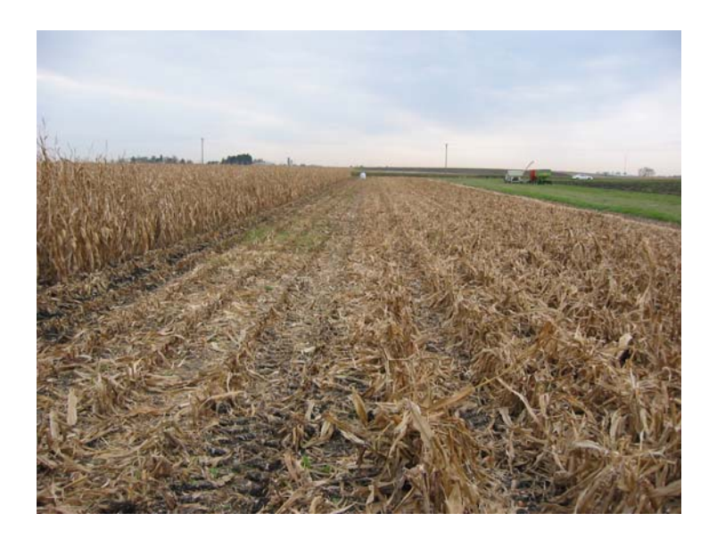
Figure 5. Stover remaining after collecting all harvestable material (left, next to standing corn) compared to removal of no residue (right).

the continuous corn site, grain and stover were harvested again according to the same treatments in 2006. Meanwhile, soybean was grown without additional fertilizer inputs on the rotated site. Where corn was grown for the third consecutive year, the overall field average declined by 10%, reconfirming previous studies (Kanwar et al., 1997; Karlen et al., 2006) that continuous corn is not a sustainable farming operation. For the rotated site, soybean yield measurements in 2006 showed a surprising 50% decrease where corn stover had been removed in 2005 compared to where it was returned to the soil (Table 1). Further investigations suggest the low soil-test P, K,